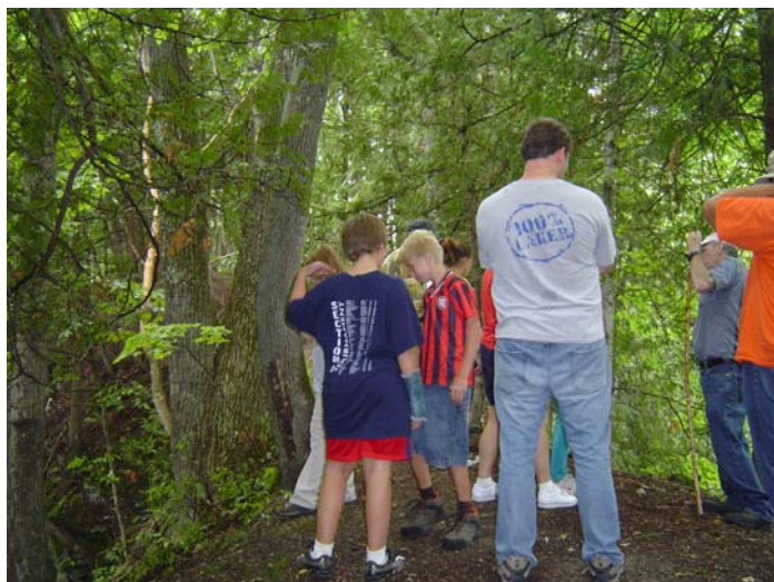
Trip participants standing on the narrow trail between two large sinkholes at the "Stevens Twin Sinks" area near Posen.