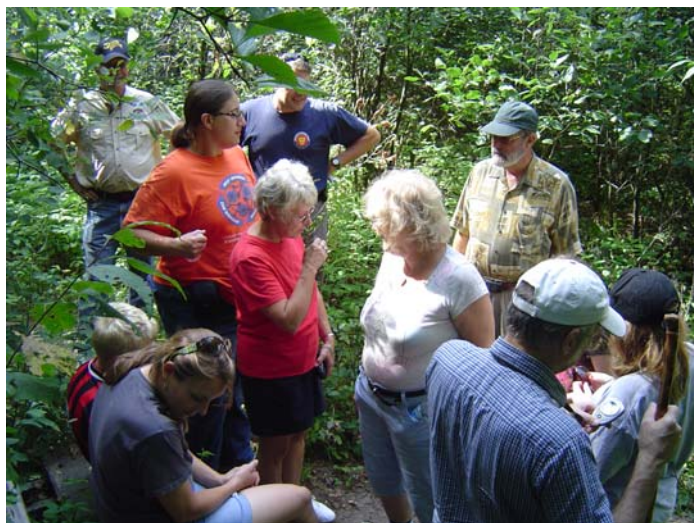
Trip participants at the bottom of one of the sinkholes at the Shoepac Lake recreation area. The elevation of the bottom of the sinkhole is about 90 feet lower than Shoepac Lake, which is about 500 feet away.