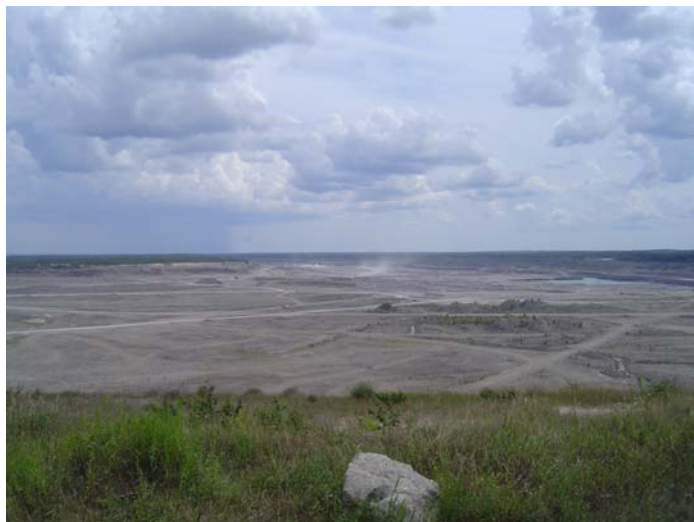
A view of the Rogers City limestone quarry. The truck hauling stone visible as a small speck in the background to the left of the dust plume has tires 10 feet high.

From there, participants drove to the overlook of the limestone quarry at Rogers City, which is currently the largest limestone quarry in the world. Quarry operations were ongoing at the time of the visit, and several of the younger participants were amazed that the very large trucks hauling stone appeared so small from the vantage point.