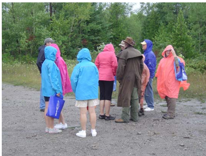
Trip participants gathering on Day 2 at the Rockport Quarry.

While most of the participants elected to make the walk into the quarry, the light rain deterred others. In less than an hour, however, it was raining so hard, that only a few diehard individuals were still collecting.